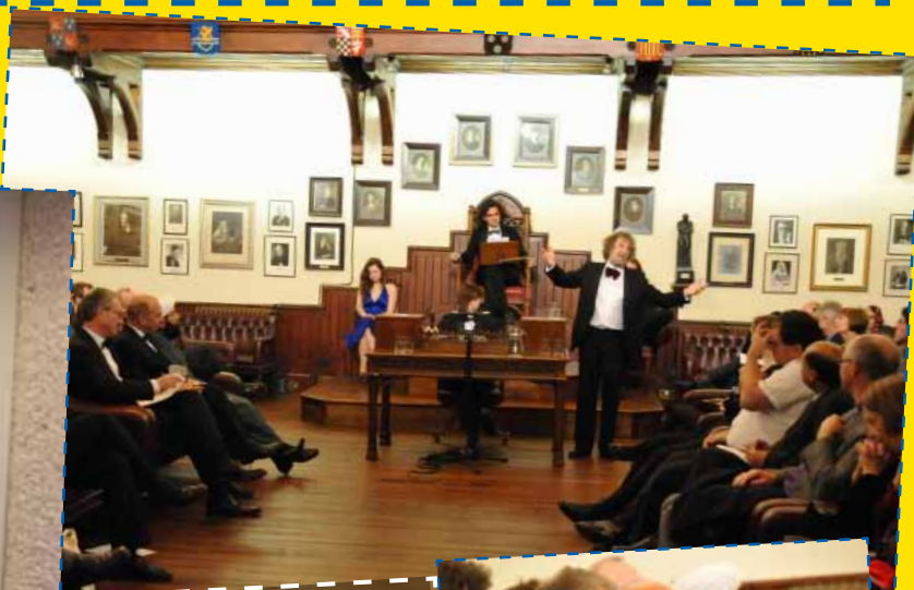
Cambridge Union Society and East of England Faiths Council Inter Faith Debate for IFW