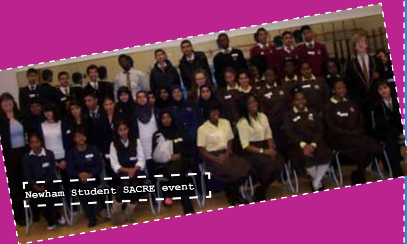
Newham Student SACRE event

Religious Education is an important and established part of the basic curriculum for maintained schools. Each Local Education Authority in England and Wales has a Standing Advisory Council on Religious Education (SACRE) which is responsible for overseeing the provision of RE and collective worship for its local authority schools. SACREs are linked together by the National Association of SACREs (NASACRE), which has taken an active role in promoting youth inter faith initiatives through awards given to local SACRE projects, funded by the Westhill Foundation.