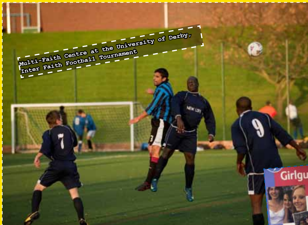
Multi-Faith Centre at the University of Derby, Inter Faith Football Tournament