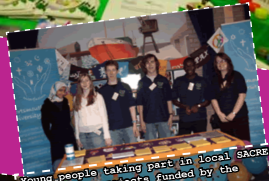
Young people taking part in local SACRE inter-faith projects funded by the Westhill/ NASACRE Awards