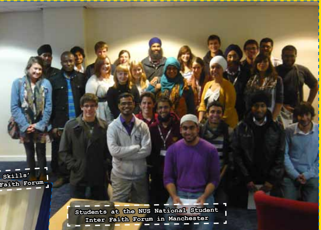
Students at the NUS National Student Inter Faith Forum in Manchester