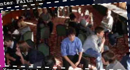
Young people taking part in local SACRE inter-faith projects funded by the Westhill/ NASACRE Awards