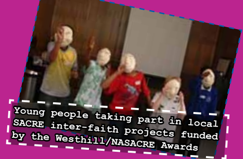
Young people taking part in local SACRE inter-faith projects funded by the Westhill/NASACRE Awards