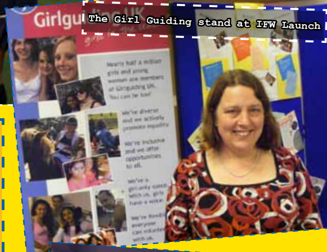
The Girl Guiding stand at IFW Launch

Youth inter faith forums are increasingly common, whether it is through young people from a number of religious youth groups engaging in dialogue or working together on a collaborative social action project in their local community, or through non-confessional youth organisations encouraging inter faith dialogue and engagement between members of their organisation who come from different faith traditions.