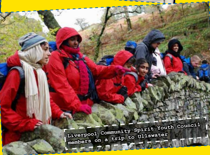
Liverpool Community Spirit Youth Council members on a trip to Ullswater