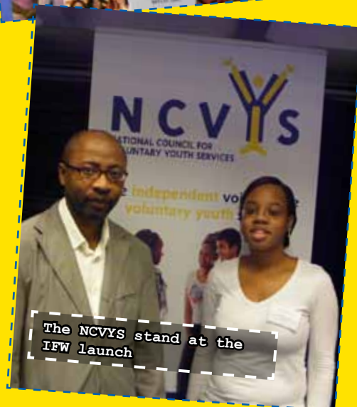
The NCVYS stand at the IFW launch