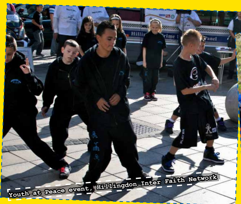
Youth at Peace event, Hillingdon Inter Faith Network