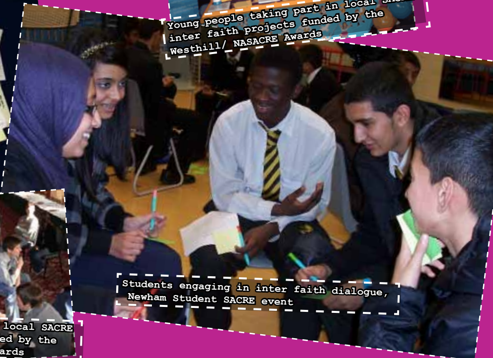
Students engaging in inter-faith dialogue, Newham Student SACRE event