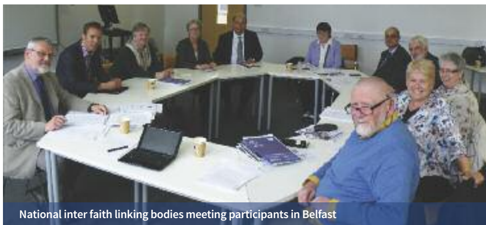
National inter faith linking bodies meeting participants in Belfast