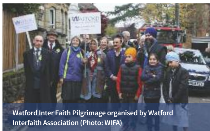
Watford Inter Faith Pilgrimage organised by Watford Interfaith Association