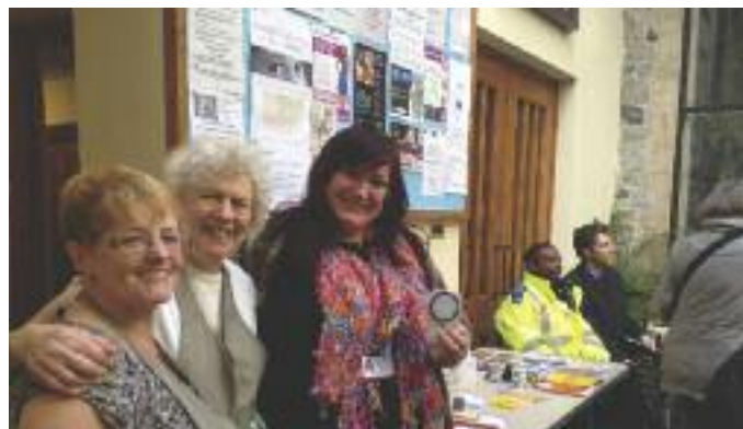
Safer Transport Team of the Metropolitan Police running an inter faith event in the London Borough of Barking and Dagenham

A separate Scottish Interfaith Week has run since 2004. Information about its events is carried on the Interfaith Scotland website www.interfaithscotland.org/scottish-interfaith-week The 2013 IFN report carried, by agreement with Interfaith Scotland, a special page about Scottish Interfaith Week.