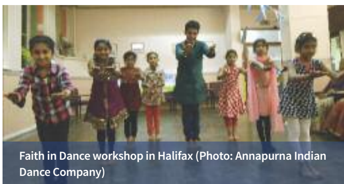
Faith in Dance workshop in Halifax