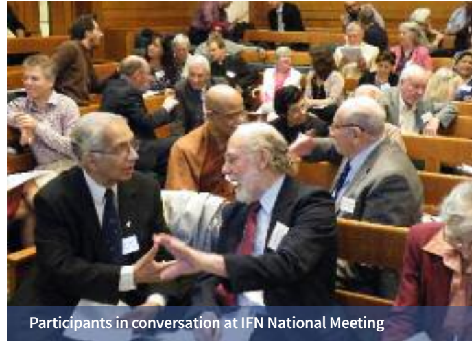
Participants in conversation at IFN National Meeting

Following the AGM, IFN had 186 bodies in membership.