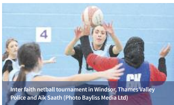
Inter faith netball tournament in Windsor, Thames Valley Police and Aik Saath