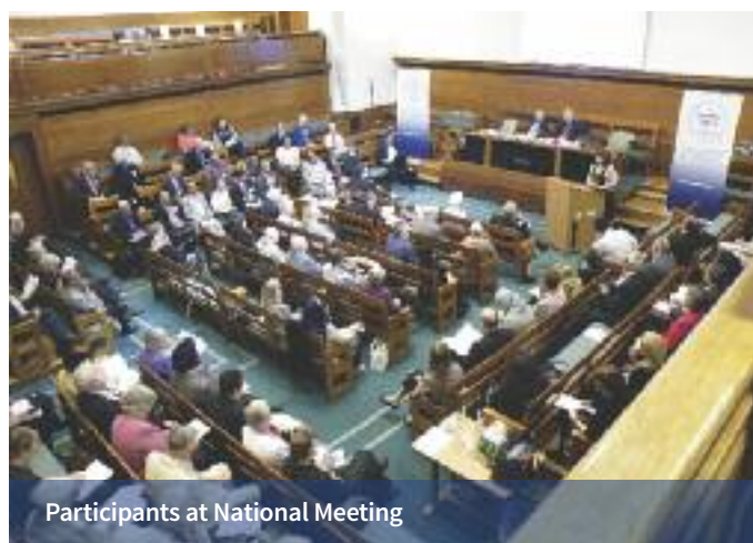
Participants at National Meeting