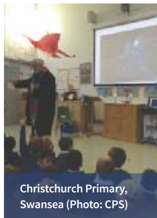
Christchurch Primary, Swansea