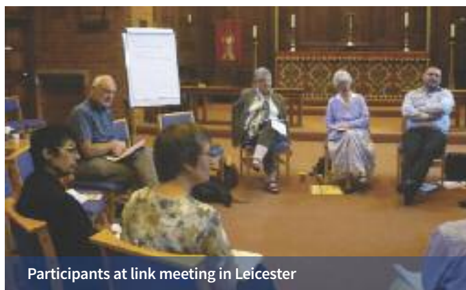
Participants at link meeting in Leicester