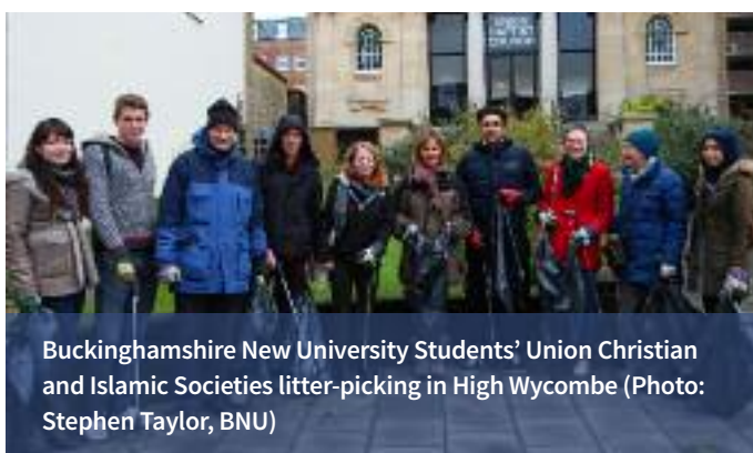
Buckinghamshire New University Students' Union Christian and Islamic Societies litter-picking in High Wycombe