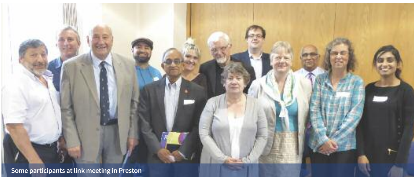
Some participants at link meeting in Preston

IFN's membership includes many local inter faith groups, forums and councils. Local inter faith initiatives draw together people from different faith traditions in a particular area. They play a very important role in creating opportunities for learning and cooperation in their local communities.