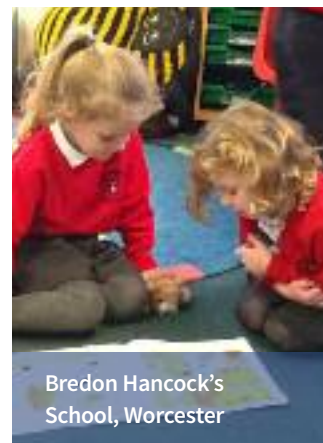
Bredon Hancock's School, Worcester