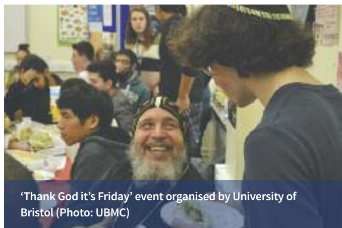
'Thank God it's Friday' event organised by University of Bristol

Some organisations, of course, carry out faith-based social action and inter faith activity year round but there are many thousands of groups and millions of individuals in our society who do not focus on these issues or necessarily see their significance. This Week is a key way to highlight the contribution faith communities make to society and the importance of inter faith – and belief – understanding and cooperation.