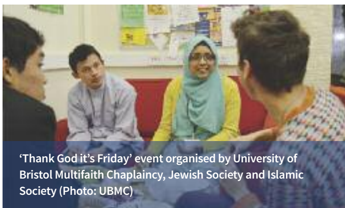
'Thank God it's Friday' event organised by University of Bristol Multifaith Chaplaincy, Jewish Society and Islamic Society